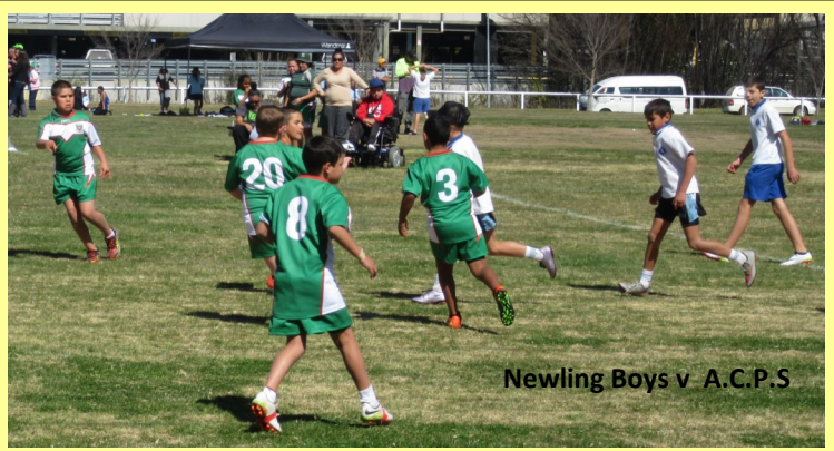
Newling Boys v A.C.P.S

Armidale Primary Schools Touch Football Gala Day was held on Thursday 18th August at Harris Park. Newling boys and girls Teams participated.