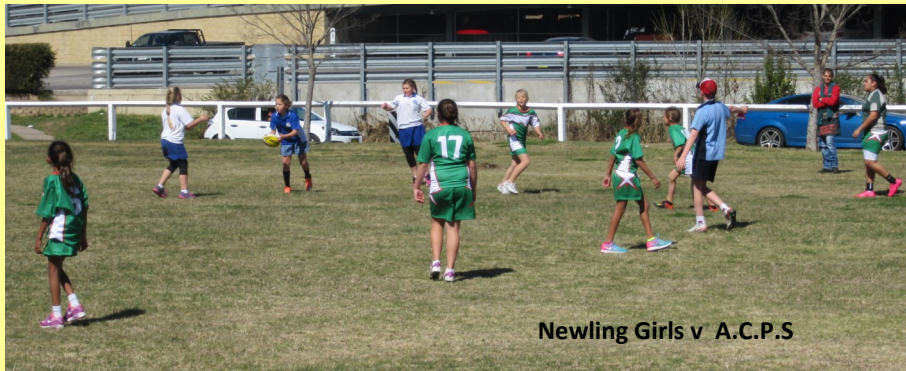
Newling Girls v A.C.P.S

The Gala Day was an excellent opportunity for Newling students to showcase their skills. They all showed great sportsmanship and looked impressive in their new team uniforms.